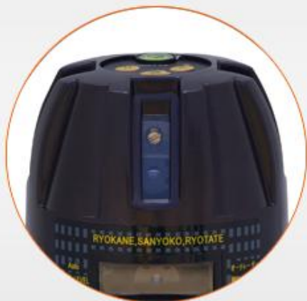
Sharp laser line and LED