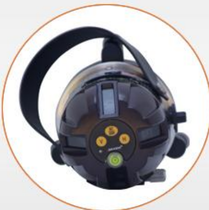
Easy touch PAD + Blister attached