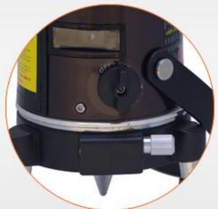
Micro knob + ON/OFF